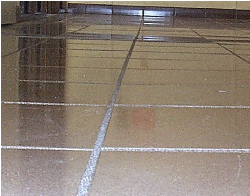
Picture 1-1 – Large format tile highlight imperfections in the substrate.

In cases where a large format tile is specified, the substrate tolerance should be tightened to maintain a tolerance of 1/8" in 10' (3mm in 3m).