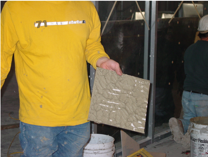
Picture 1.4 – Ceramic tile removed during the installation to verify proper coverage is being attained. Notice the lower right hand corner of the tile is lacking coverage. This will undoubtedly lead to a cracked tile.

Size of the tile will also determine exactly what tools are required to properly bed the tile. The simple logic is that the larger the tile, the larger the notch trowel size must be. A 1/4" x 1/4" (6mm x 6mm) square notch trowel might be fine for a 4 1/4" x 4 1/4" (108mm x 108mm) tile; it will not be suitable for installation of 20" x 20" (500mm x 500mm) tile. It is important that this be understood, and that the installer pulls tiles up after they are installed to make sure that the desired coverage is achieved and that the surface of the tile installation is flat and true. Industry standards require that a minimum coverage of 80% be attained for interior, non-wet areas, and a minimum coverage of 95% be attained for any interior, wet-area or any exterior installation. There have been significant advances made in trowel technology over the past few years that help make the installer's job easier. General guidelines for trowel/tile size are;