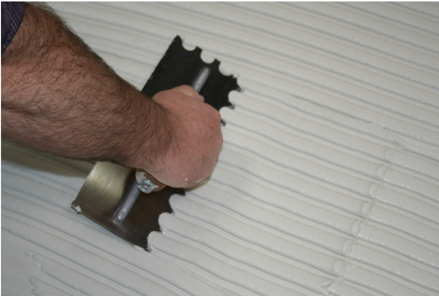
Picture 1.2 - \frac{3}{4} " (18mm) loop notch trowel with a medium bed mortar used for large format tiles or stones. Trowel thin set mortar in one direction holding trowel at a 45 degree angle. Notice the full ribbons of mortar that left behind.